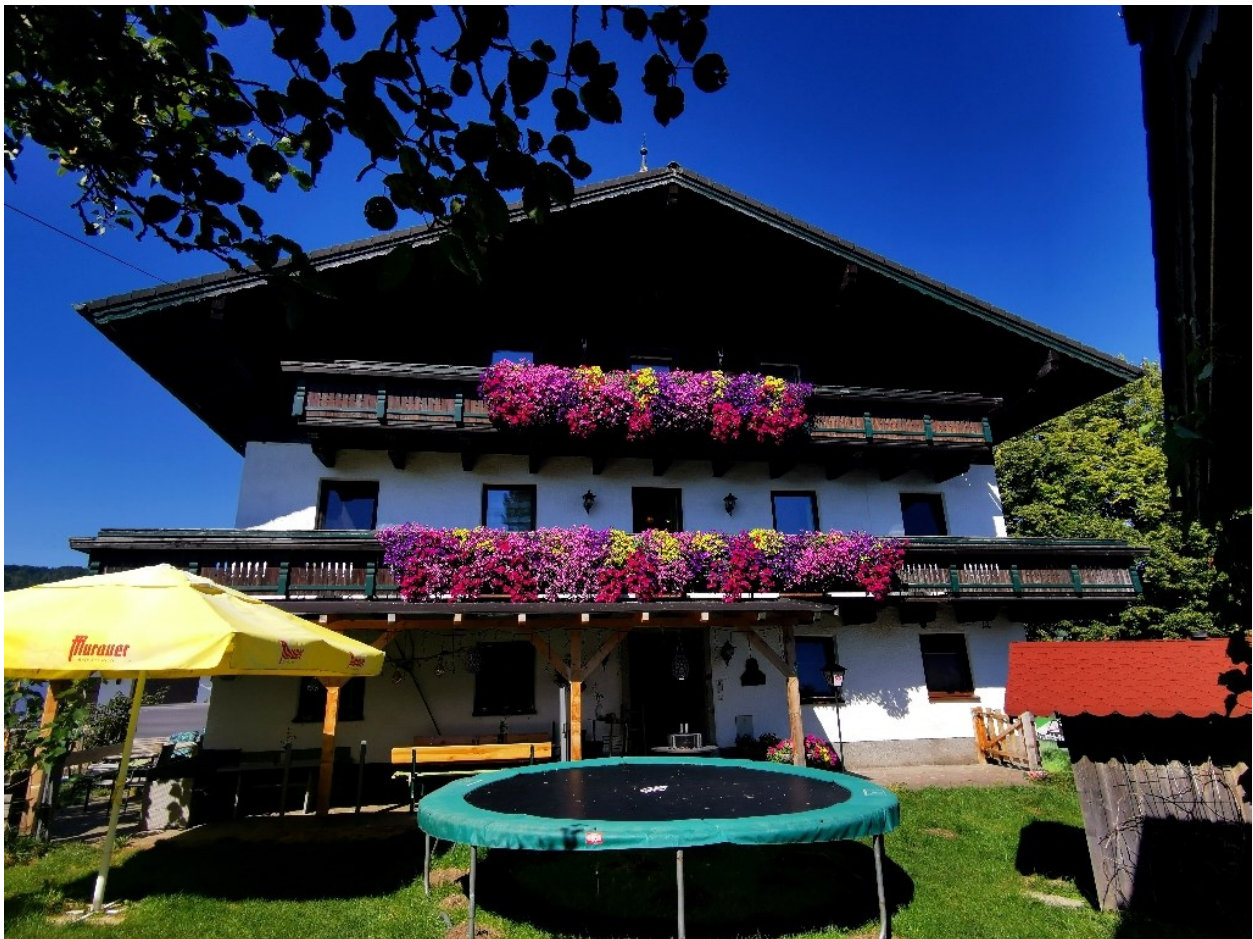
Figure 4: Overnight stays at "Schusterbauer"