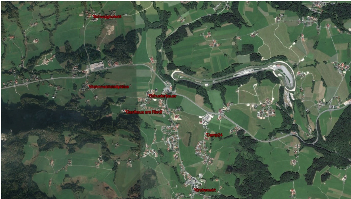
Figure 1: Accommodation in and around Koppl

Close to the venue Koppl, we can recommend a couple of accommodation opportunities (Figure 1). We also recommend reserving your place soon, since other events in and in the surrounding of Koppl are taking place at the same time. Details on costs and available infrastructure can be accessed via the homepage of each provider. All costs mentioned within this manuscript are based on the best knowledge of the management board and might have changed meanwhile. For the locations of the accommodations, please see > NocksteinTrophy_Accommodation.kmz .