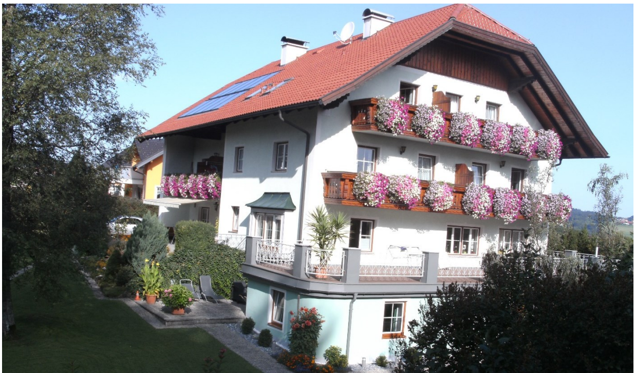
Figure 9: Pension Waldhof