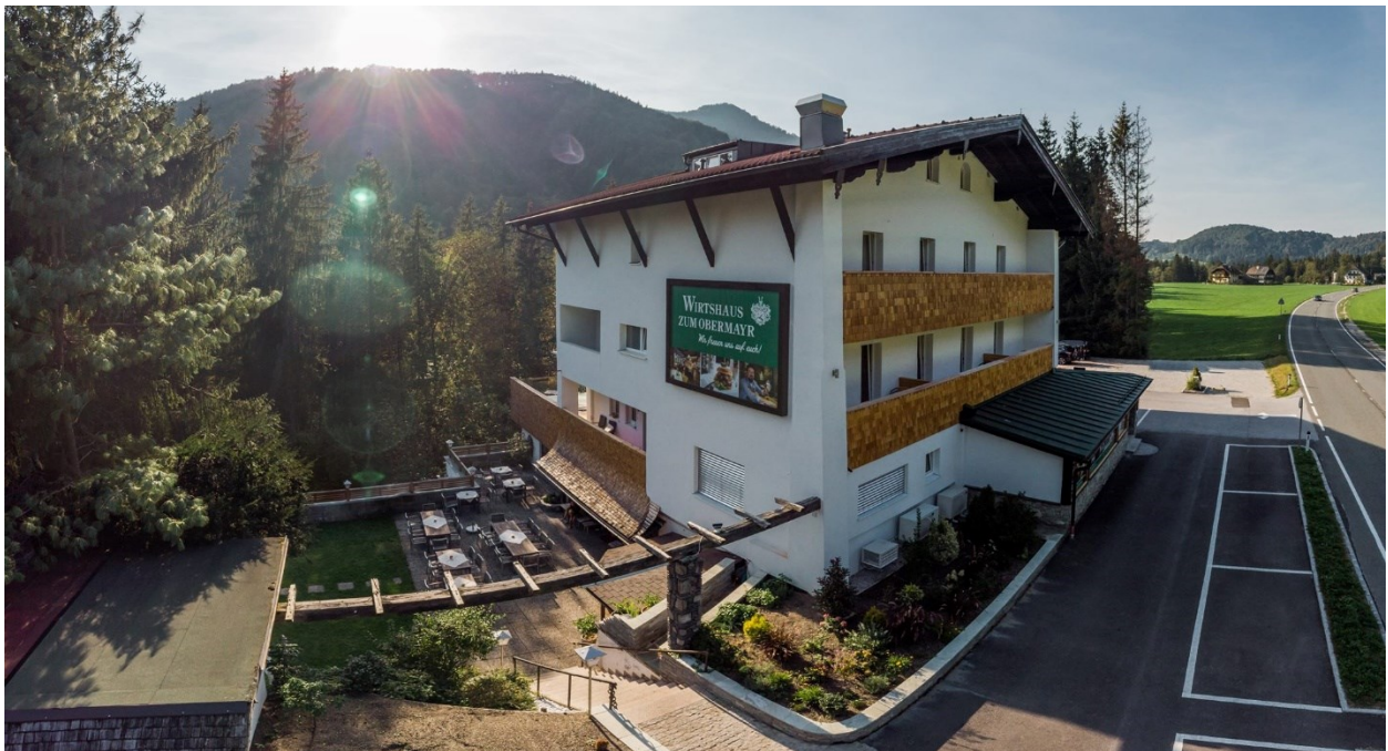
Figure 11: Hotel Obermayr