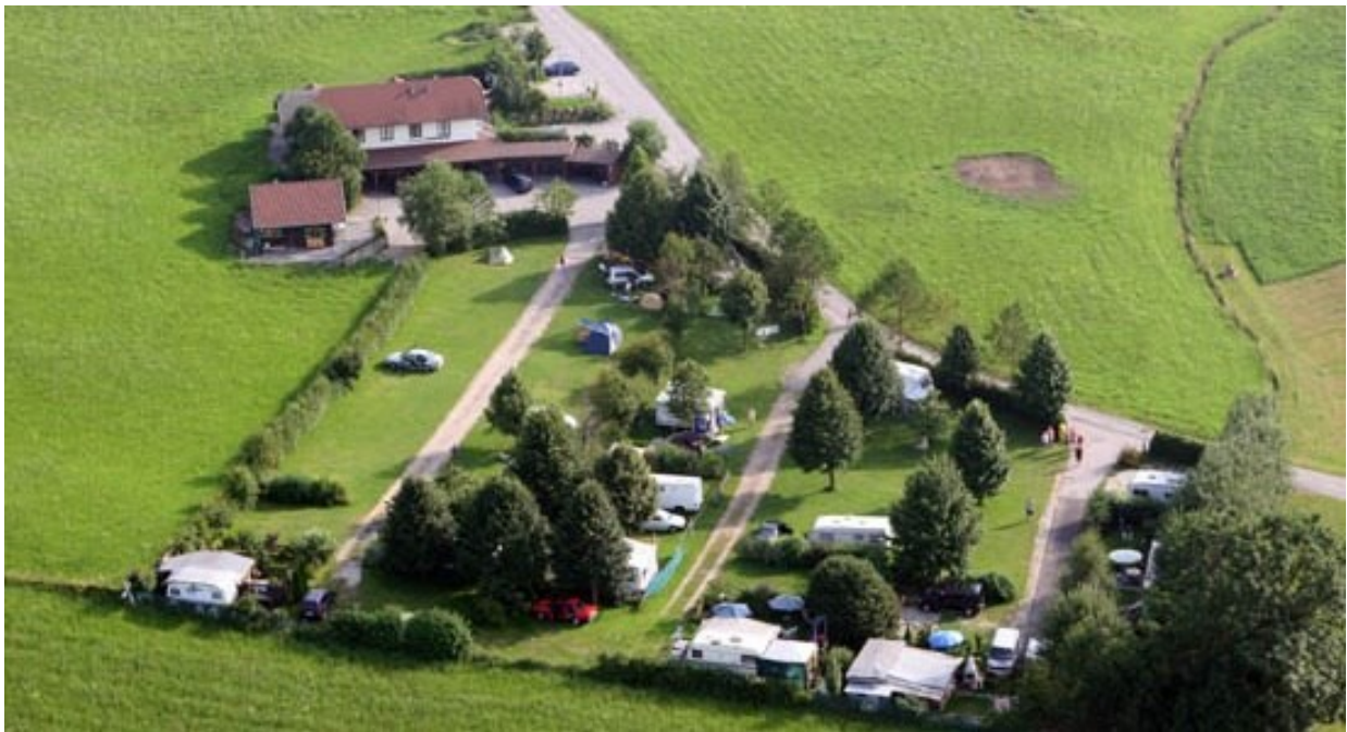
Figure 3: Camp24

[W] http://www.camping-salzburg.at/camping/home/