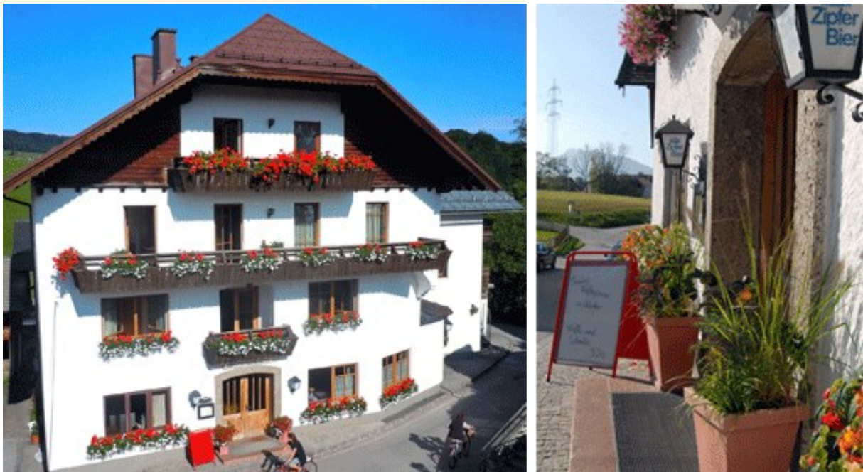
Figure 5: Gasthof Kirchenwirt