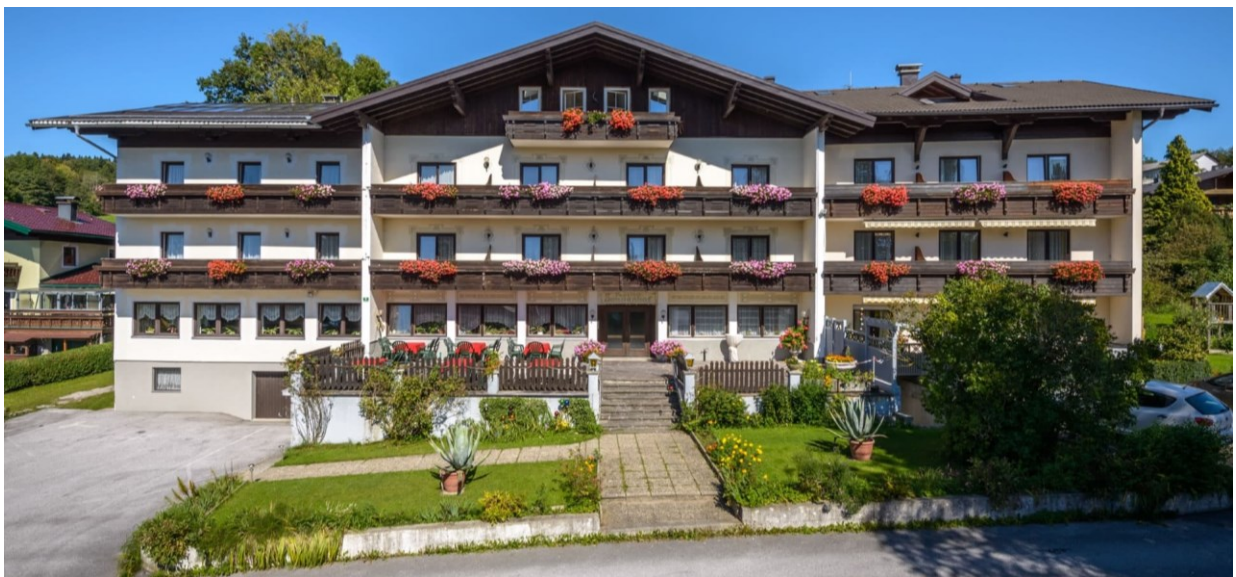
Figure 8: Pension Sonnenhof