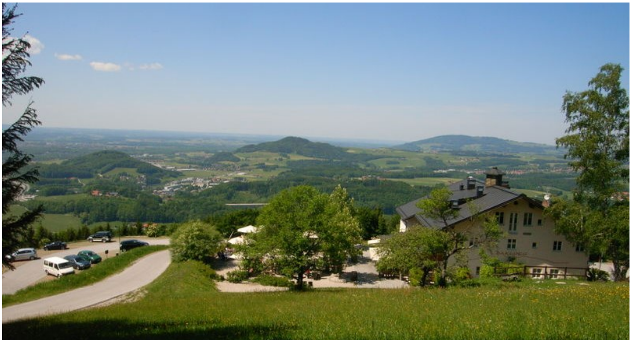
Figure 10: Hotel Dax Lueg