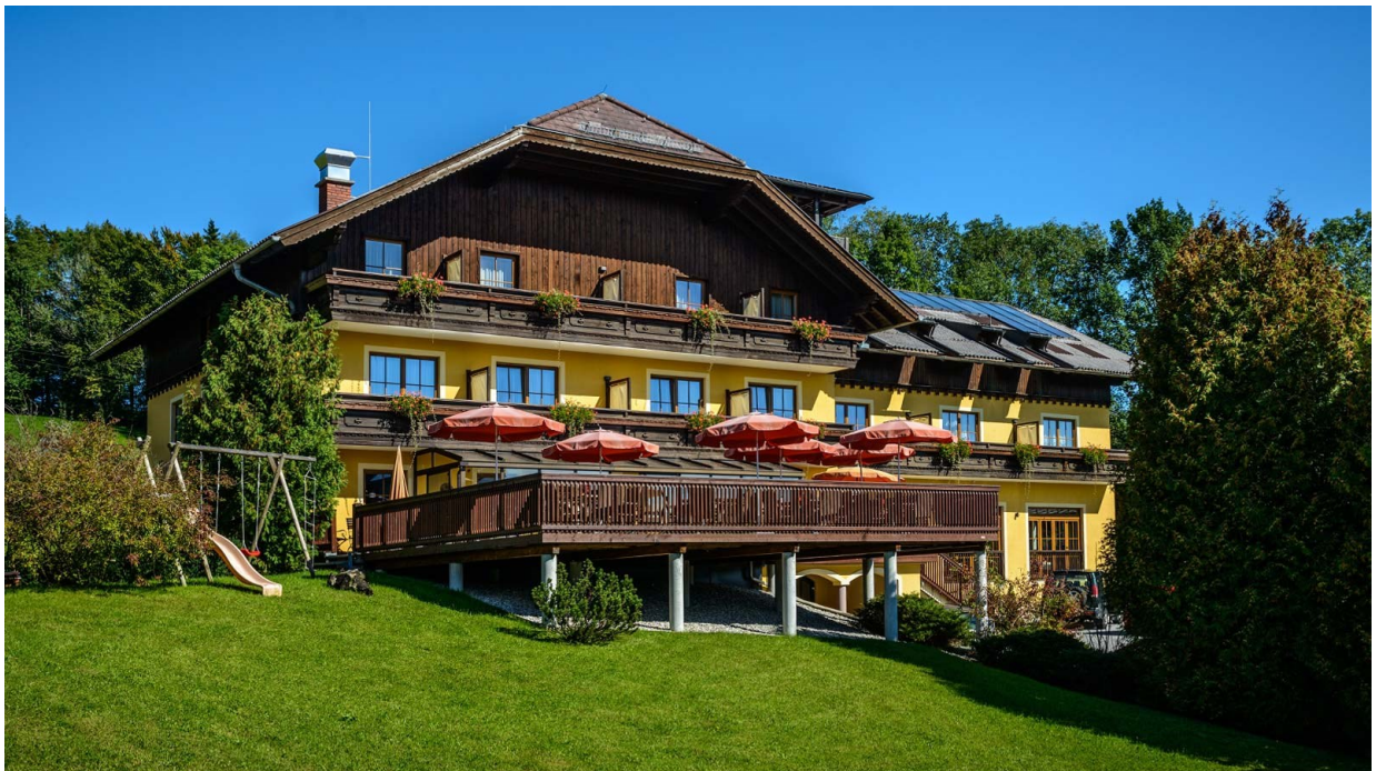
Figure 7: Hotel Pension Schwaighofen