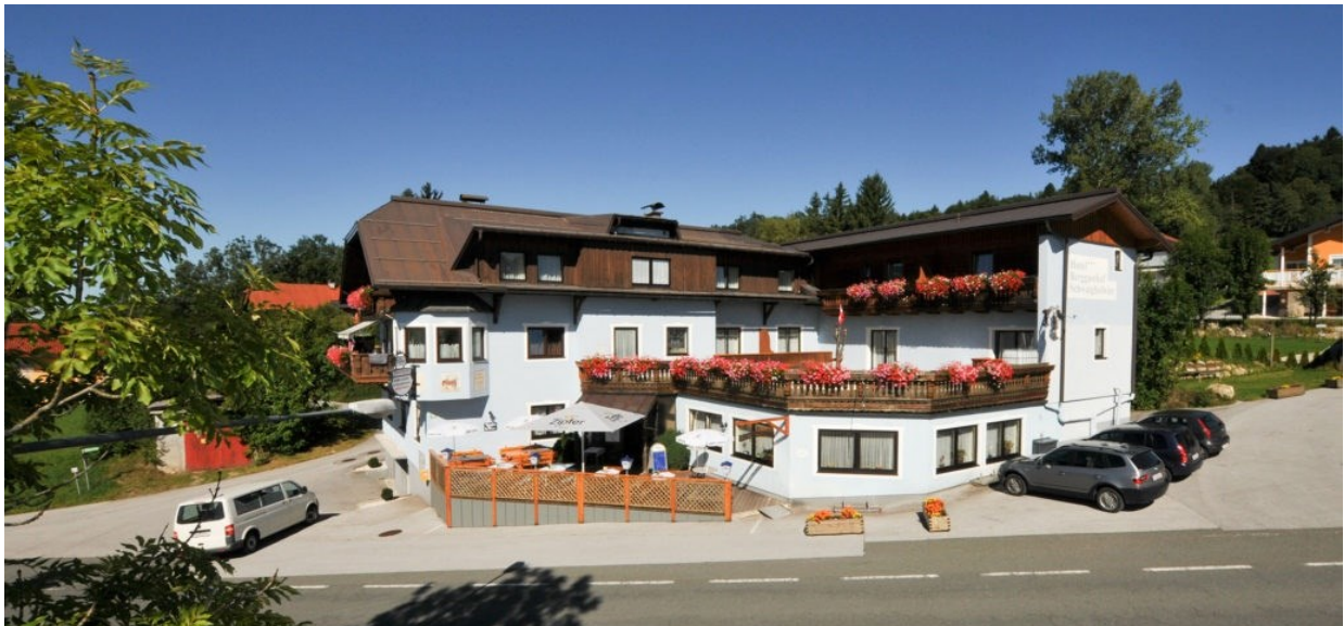
Figure 6: Hotel-Berggasthof Schwaighofwirt