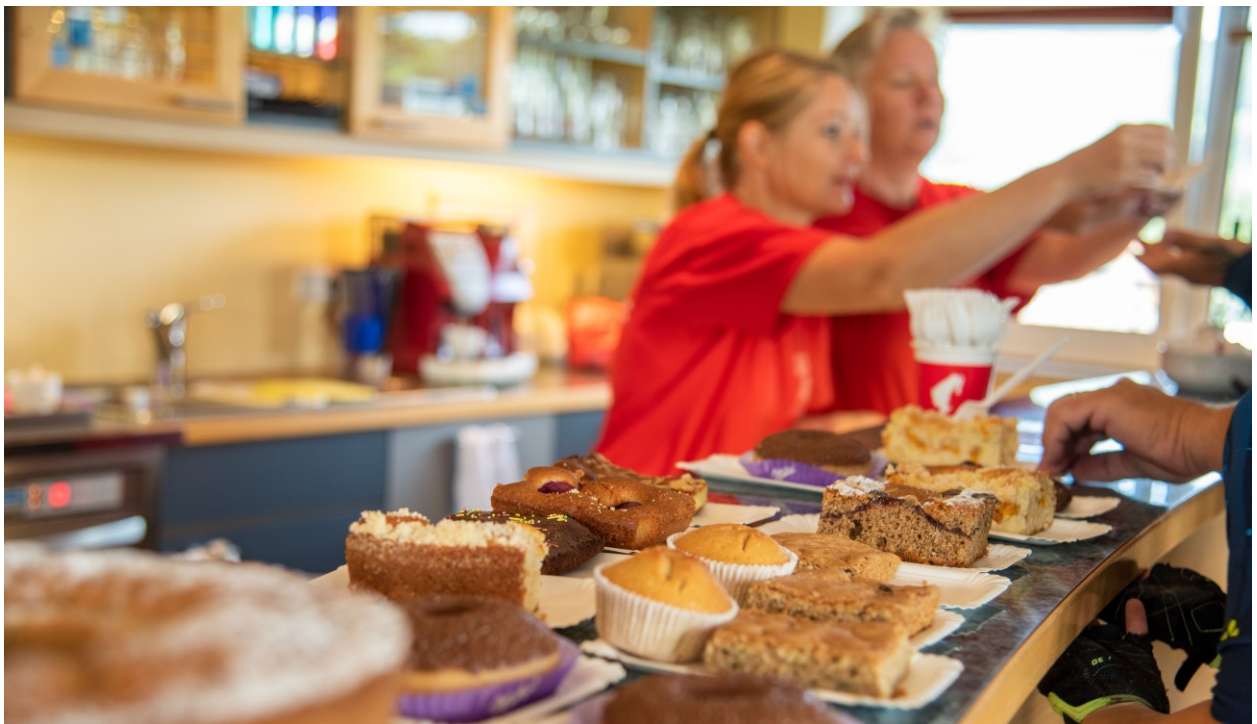
Figure 6: Catering with food and drinks in the club house