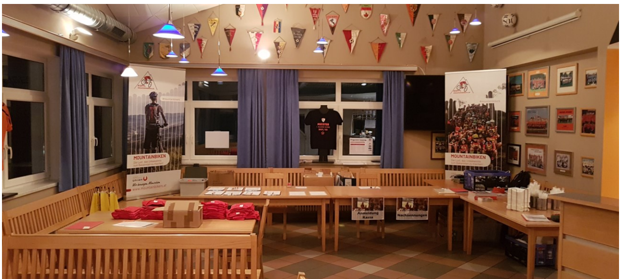
Figure 4: The club house