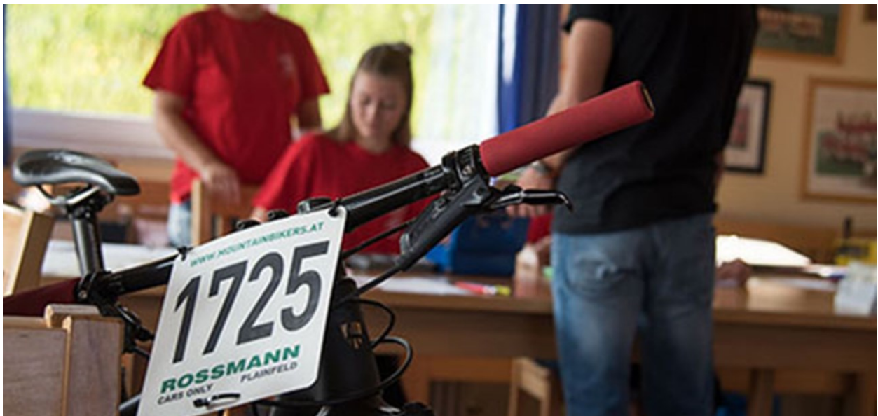
Figure 1: The start number at the handlebar

After a hopefully carefree journey to one of the available parking spaces, you can register. This is where the participants are registered, the license is checked (Saturday) and the entry fees are paid. Entry fees are only accepted in cash. Please have the money ready. There is NO option to pay by card! Furthermore, the starters will be given the handlebar number (including cable ties, Figure 1), the back number (including four safety pins) and the transponder (including cable ties) to attach to the right-hand side of the fork.