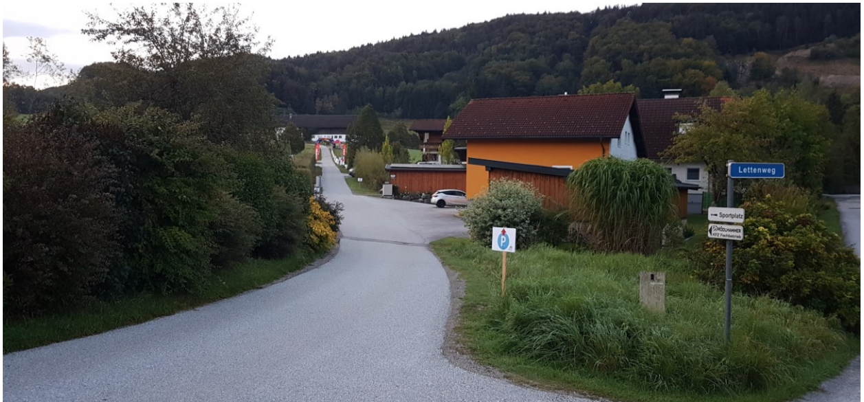
Figure 2: Left way from the parking to the club house and start/finish line