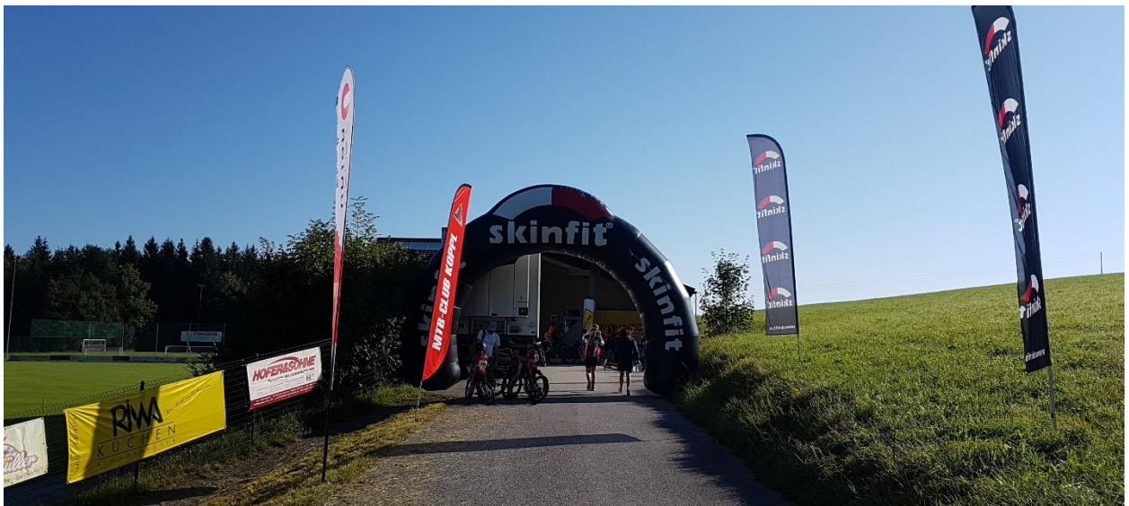
Figure 3: On your way to the club house