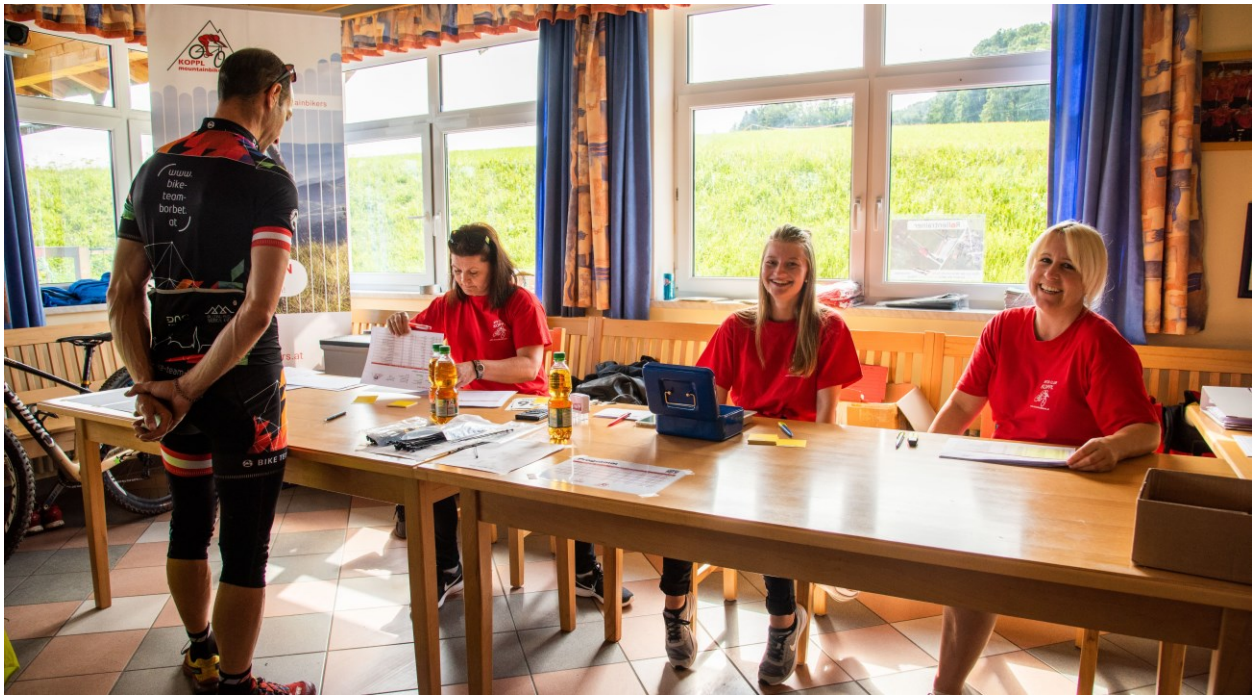
Figure 5: The enrolment office